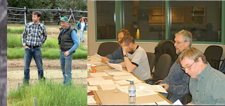
Archive photo, unknown.