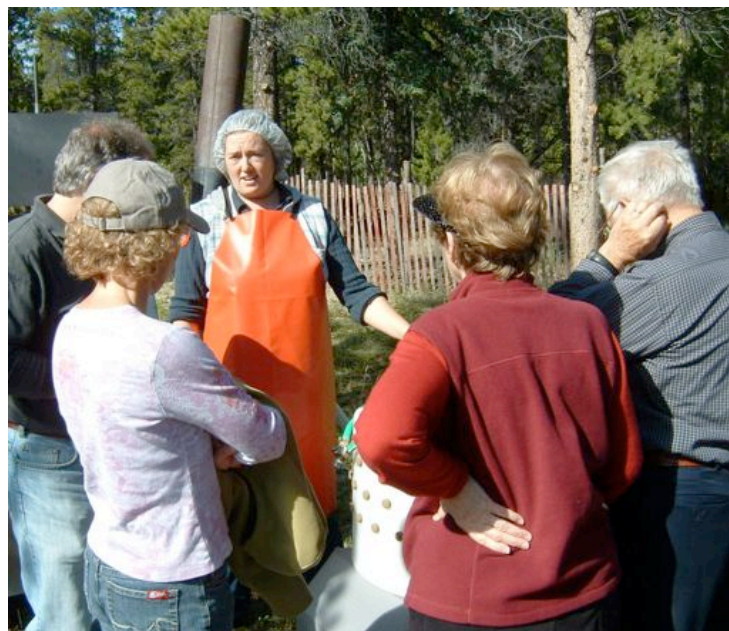
Demonstrating the mobile chicken abattoir at the Mt Lorne Community Centre Wildwood Festival

and let us know what machinery you need serviced, - the year, make and model, and a description of the problem. We are making a list of people who need a farm mechanic. If we get enough interest, it may be worth while for a southern machinery dealer to send a mechanic to Yukon for one or two weeks in late March or April to service equipment right on our farms. If a shop is required for your service work, and you do not have one, perhaps an arrangement may be made with a neighbor who has a facility. Regarding costs, each person would have to pay his own service and repair charges directly. As for travel costs, we hope we may be able to get help, but even if not, having a group of users share those costs sure beats having to pay for it all individually. First though, lets determine whether there is enough interest. No promises here, but let us know your needs and we will see what we can do.